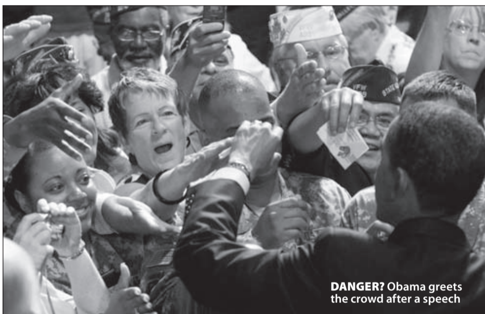
DANGER? Obama greets the crowd after a speech

The constant comparisons of Obama to that arch-socialist Hitler also have this aim. They saw the Tom Cruise movie. Any action against a Hitler is justified.